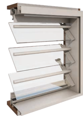
The Easyscreen Window System with (optional) integrated D bar security system. Suits 152mm louvres only.