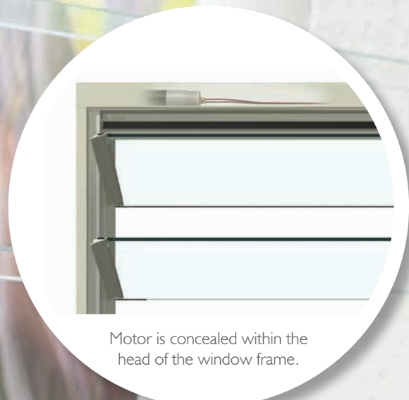
Motor is concealed within the head of the window frame.